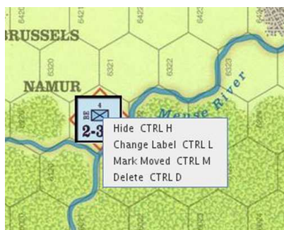
Figure 8: A sample command menu, showing 4 commands and associated hotkeys

Use of the command menu will vary from module to module. In some modules, all piece control, even movement, is performed by right-clicking and choosing a command. In some, the right-click menu is more modest and contains only a few simple commands, such as to clone or delete the piece.