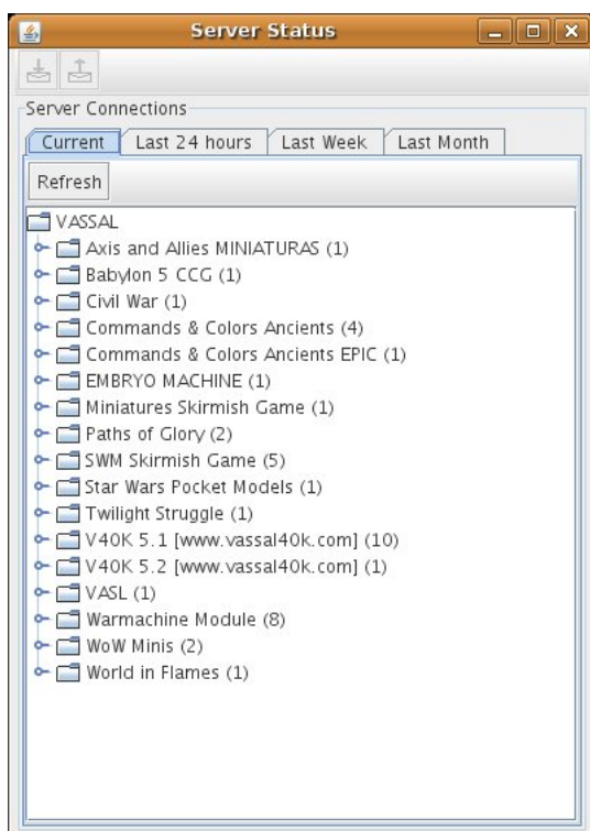
Figure 5: The Server Status window, showing all current games and the number of players