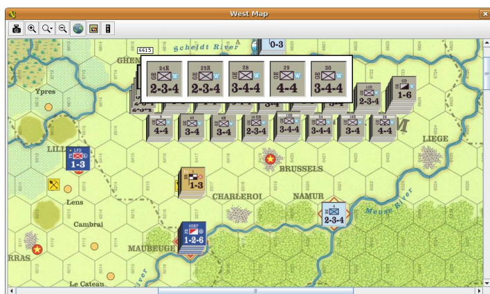
Figure 9: The stack viewer, displaying the contents of a stack of pieces

Most Vassal modules include a stack viewer. Hold your mouse cursor over the stack and the component pieces in the stack will be displayed, left to right.